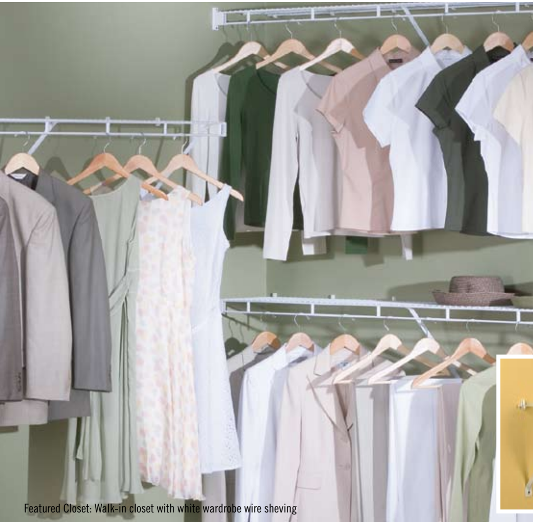
Featured Closet: Walk-in closet with white wardrobe wire shelving

Add even greater functionality to your storage space by upgrading your shelving, adding more hanging space and including shelf stacks. For a touch of elegance, add the look of built-in furniture from our Heirloom Collection™ of laminated wood closet systems.