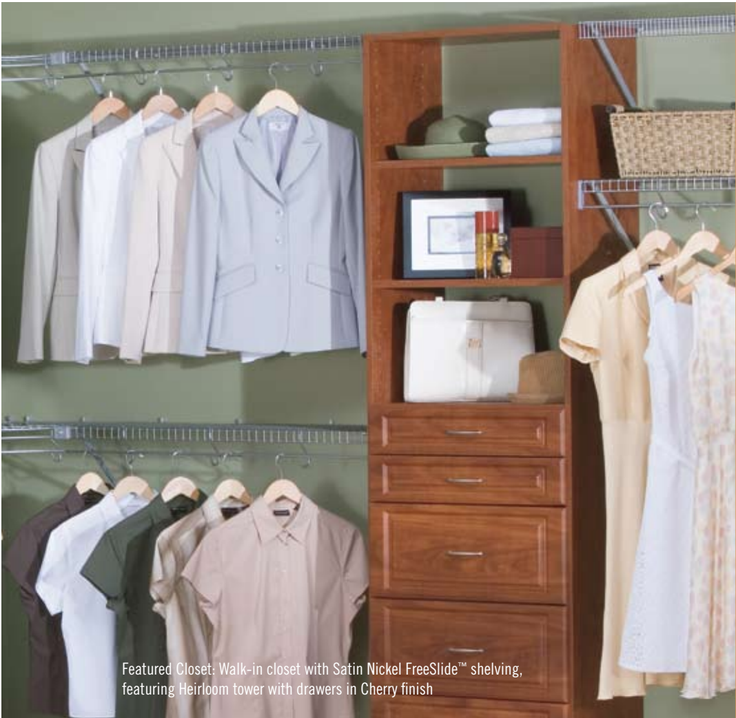
Featured Closet: Walk-in closet with Satin Nickel FreeSlide™ shelving, featuring Heirloom tower with drawers in Cherry finish

Rubbermaid's Heirloom Collection™ of laminated wood storage systems will add affordable elegance to your master closet. Many decorative options are available, in four stylish finishes: White, Maple, Cherry and Mahogany.