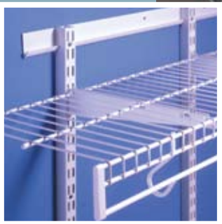
Featured Closet: Reach-in closet with white wire shelving and FastTrack® hardware

As your family grows and your needs change, you can count on Rubbermaid® storage systems to change along with you. You can configure your storage with adjustable shelves and arrange everything to serve your needs.